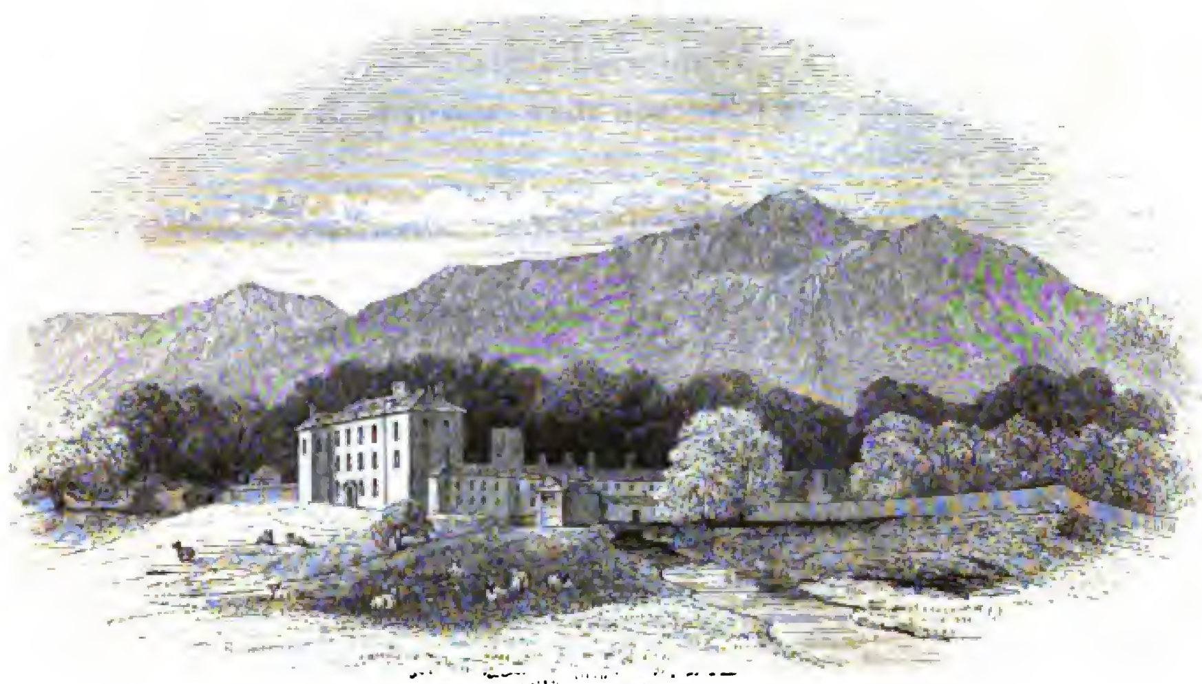
SOUTH FRONT OF BLAIR CASTLE.